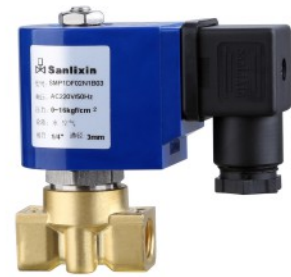
Parameters of the solenoid valve with old type& new type coil